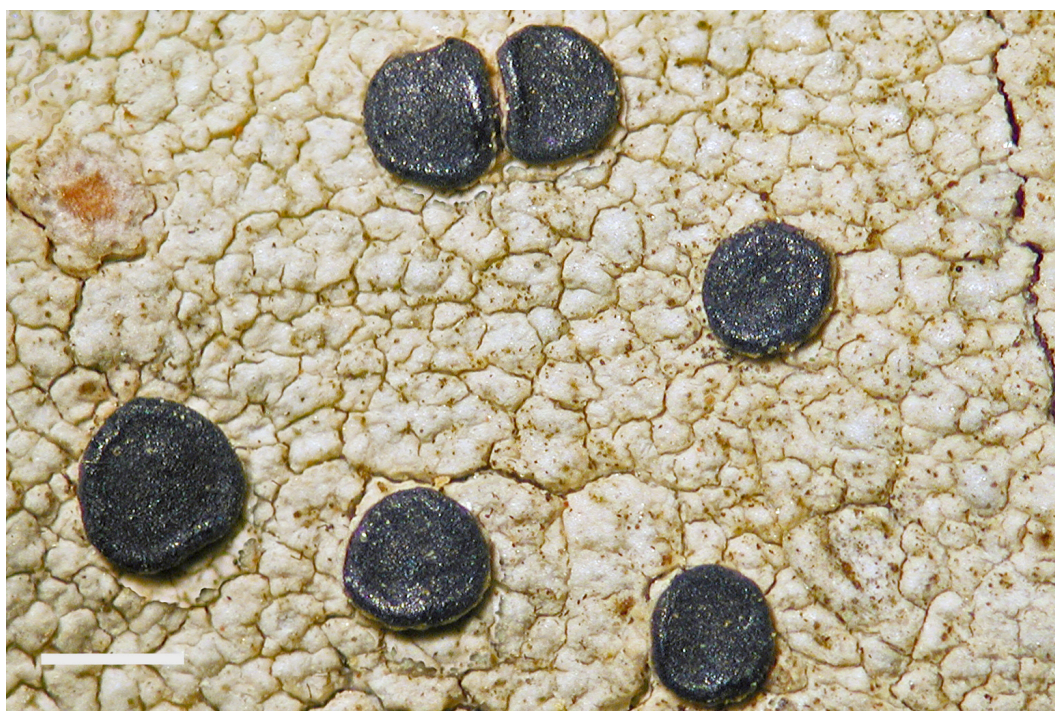
Fig. 6: Pyrrhospora endaurantia (holotype), thallus and apothecia, bar 0.5 mm

Etymology. The specific epithet refers to the orange-red subhymenium and orange hypothecium.