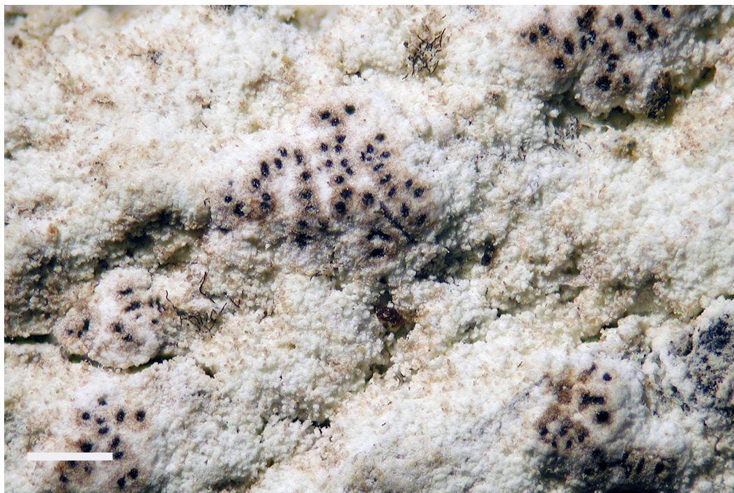
Fig. 2: Chiodecton leprarioides (holotype), thallus and ascomata, bar. 0.3 mm

TYPE: RÉUNION. Cirque de Cilaos, climb towards Col du Taïbit, on tree bark in secondary scrub forest, 21°07' S, 55°28' E, alt. c. 1300 m, 22 August 1991, K. Kalb & A. Kalb 33256 (B—holotype).