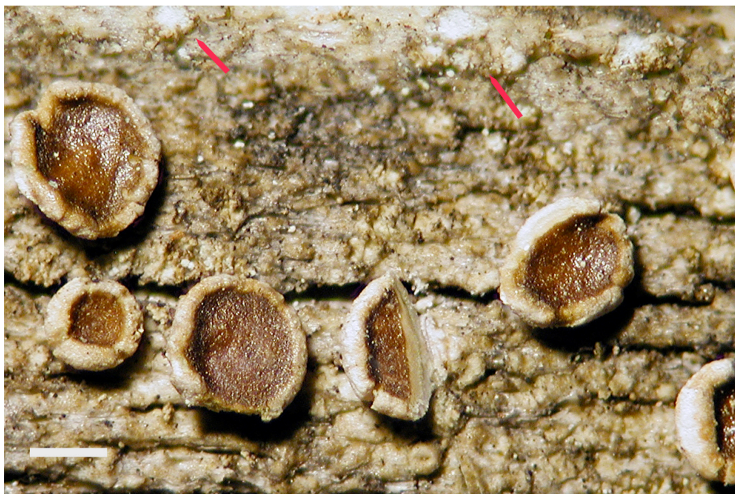
Fig. 5: Neoprotoparmelia fuscosorediata (holotype), thallus with soredia and apothecium, bar 0.3 mm

TYPE: KENYA. CENTRAL PROVINCE: Nanyuki District, between Nanyuki and Naro Moro, on wood in savannah, alt. c. 2050 m, August 1985, K. Kalb & A. Schrögl 13376 (B—holotype).