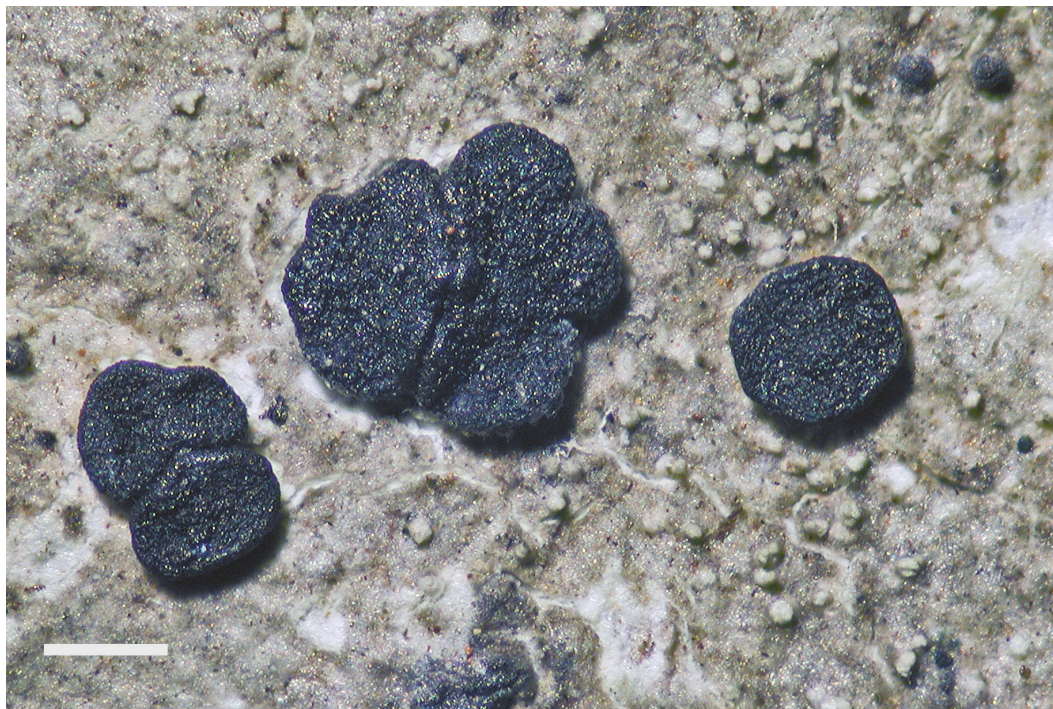
Fig. 8: Tapellaria isidiata (holotype), thallus with apothecia and isidia, bar 0.4 mm

Notes. This is the first Tapellaria reported with vegetative propagules (Neuwirth & Stocker-Wörgötter 2017). The isidia seem to be clearly belong to the thallus, and the apothecia seem to belong to the thallus as well. the internal structure and pigmentation confirms well with some other species of Tapellaria .