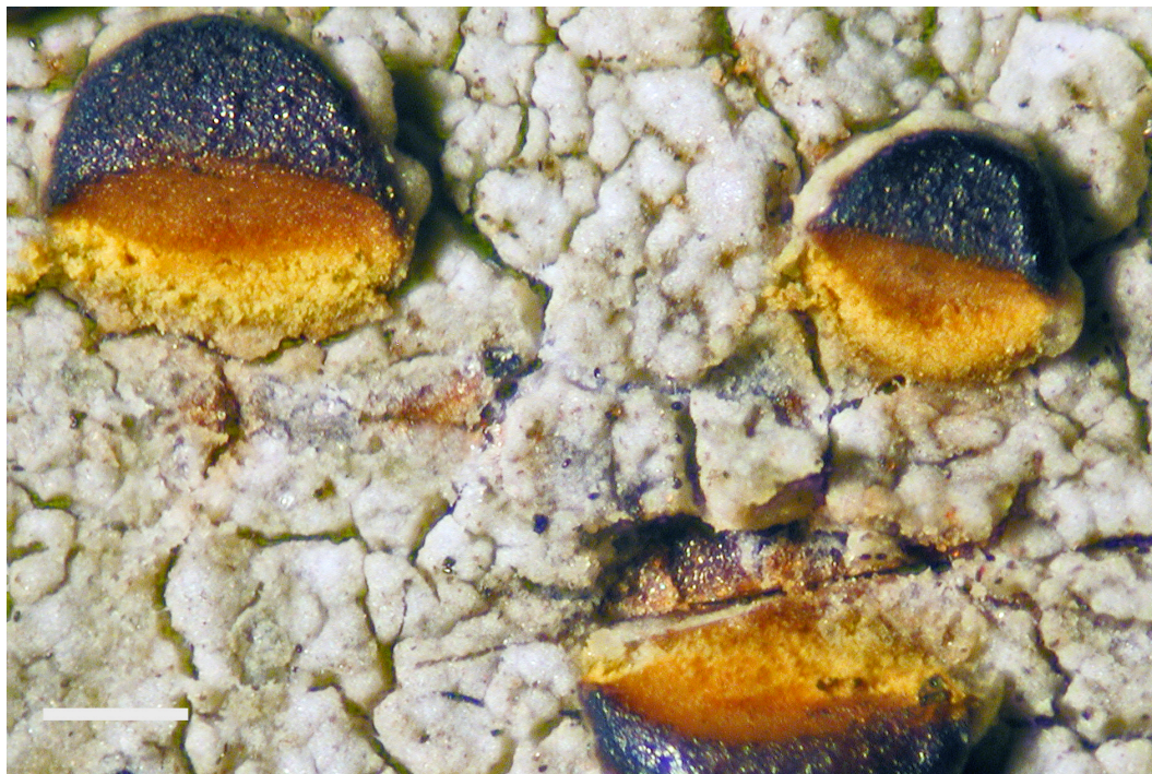
Fig. 7: Pyrrhospora endaurantia , sections through apothecia, showing the orange-red subhymenium and orange hypothecium, bar 0.2 mm

Tapellaria isidiata Kalb & Aptroot, sp. nov.