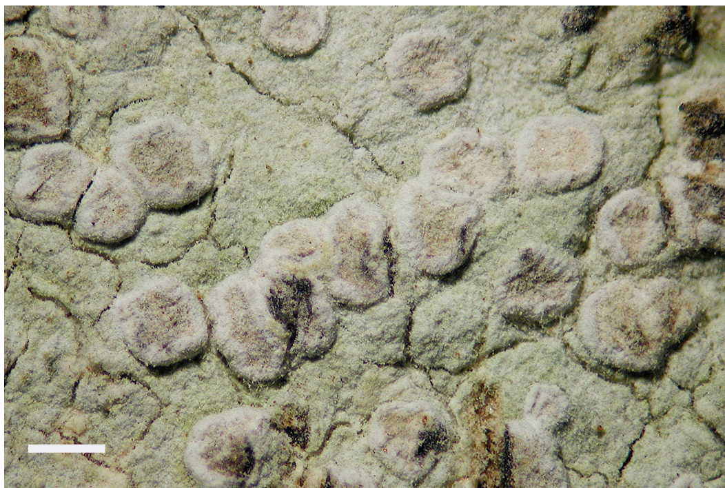
Fig. 3: Lecanactis leprarica (holotype), thallus and apothecia, bar 0.5 mm

Chemistry. Thallus and apothecia K + becoming red. TLC: Lepraric acid (major) and norstictic acid (minor).