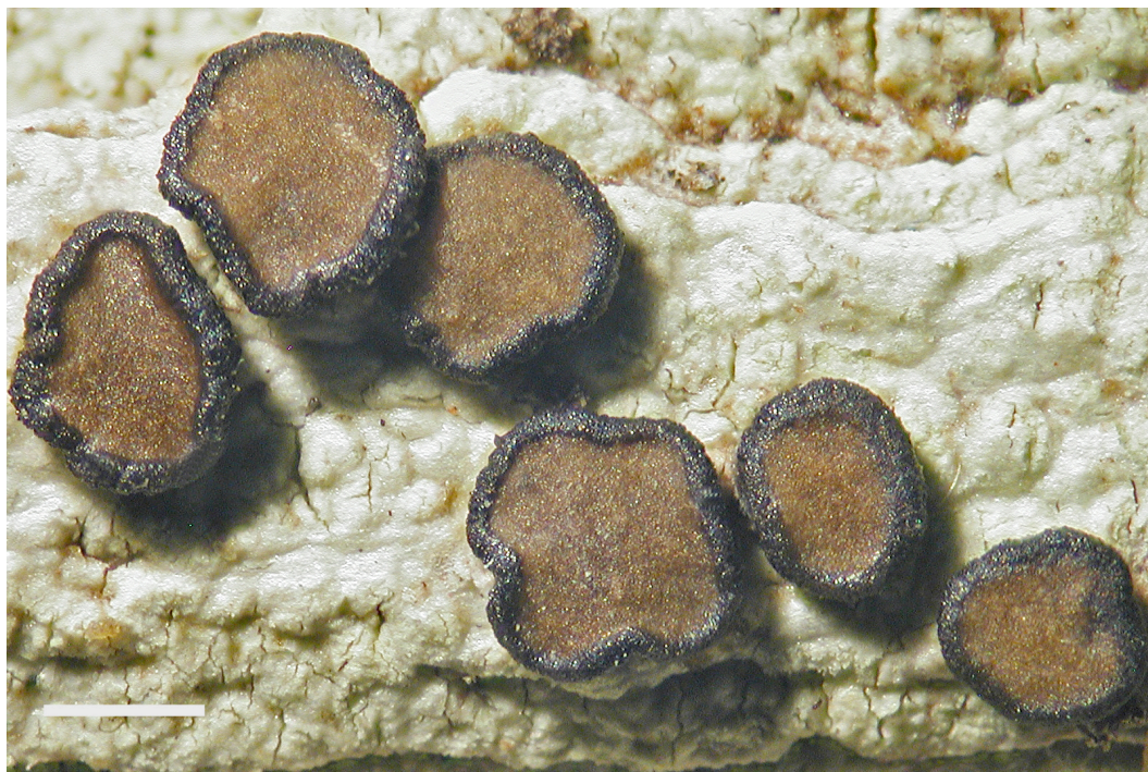
Fig. 4: Multisporidia nitida (holotype), thallus and apothecia, bar 0.5 mm

Etymology. The generic epithet refers to the polyspored asci and the specific epithet refers to the glossy apothecia.